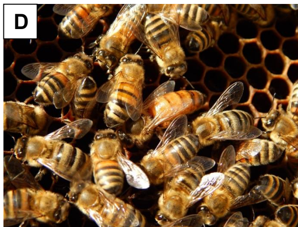
Figure 1. Queens and worker bees: 1A) A. m. ligustica , Isola Vicentina, Vicenza, Italy; 1B) A. m. siciliana , Palermo, Sicily, Italy; 1C) A. m. mellifera , Airole, Imperia, Italy; 1D) A. m. carnica × ligustica , University of Udine apiary, Udine, Italy.