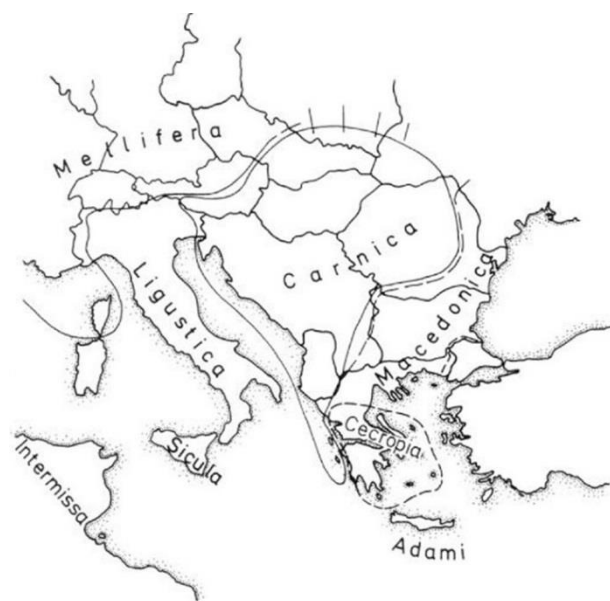
Figure 3. South-eastern Europe A. mellifera subspecies map, from Ruttner (1988).

In Italy, a unique case in Europe, there are natural populations attributable to 4 subspecies. A. m. ligustica (figure 1A) and A. m. siciliana (figure 1B) are endemic Italian subspecies; A. m. mellifera (figure 1C) and A. m. carnica (figure 1D), probably present only as populations crossbred to different degrees with A. m. ligustica . As regards the original distribution of honey bee subspecies in Italy, as well as Friedrich Ruttner's unsurpassed work 'Biogeography and Taxonomy of Honeybees' (Ruttner, 1988), we can refer to a previous Italian paper published in 1927 by Anita Vecchi, entitled: 'Sulla distribuzione geografica dell' Apis mellifica ligustica Spin. in Italia' (Vecchi, 1927). In this paper, Anita Vecchi analysed the chromatic patterns of numerous Italian populations, identifying honey bees with large clear bands in the first abdominal tergites in most of the peninsula, the presence of completely black honey bees in northern Italy and Sicily, and the presence of intermediate colours in certain areas. In the map presented by Anita Vecchi is reported the colour pattern distribution of Italian honey bee (figure 2). This distribution of A. mellifera subspecies in Italy, substantially confirmed by Ruttner's study, is well represented by the distribution map published in his above cited text (figure 3).