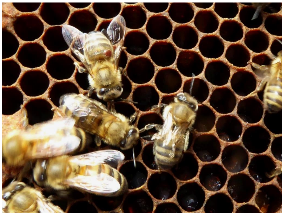
Figure 8. Worker honey bees with V. destructor mite and with symptoms of deformed wing virus (Photo by Paolo Fontana).

queen encounters only males that are related to each other, following the large-scale reproduction of selected queens, it is as if she had mated with a small number of males and polyandry will not achieve the expected results (Tarpy and Page, 2002).