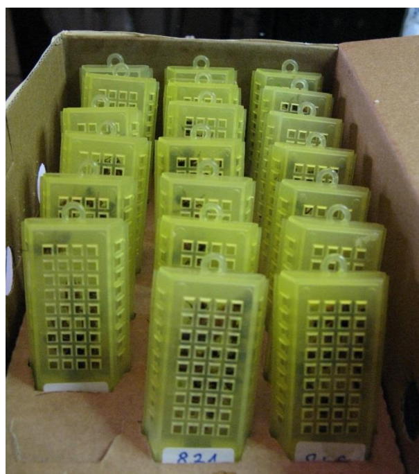
Figure 6. Honey bee queen of A. m. ligustica ready for shipping (Photo by Cecilia Costa).

queens) from one region of Europe to another by beekeepers (De La Rúa et al. , 2009; Meixner et al. , 2010). Several subspecies of A. mellifera have been involved in this movement (figure 6). There is documentation at least from the 19 th century of how certain colonies of subspecies known to be particularly gentle or productive, or even because they are ‘aesthetically pleasing’, such as A. m. cypria , have been transferred from their area of origin to different regions of Europe (Canestrini,