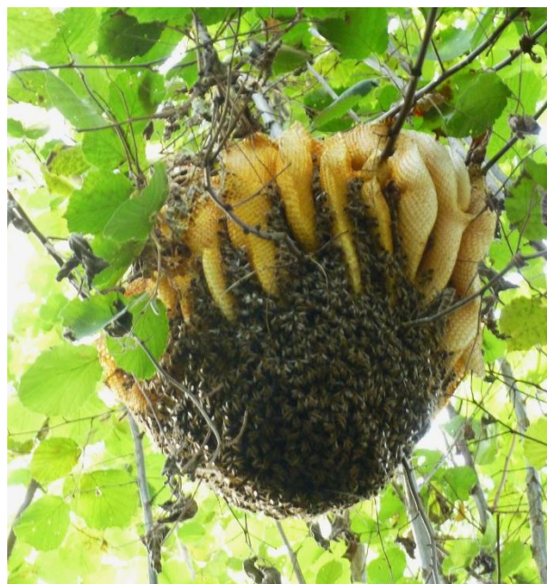
Figure 5. Feral honey bee colony in a mesophilic wood on the hills of Isola Vicentina, Vicenza, Italy; September 2013 (Photo by Damiano Fioretto).

1) The first, already known since ancient times, albeit to a lesser extent, is the moving of bees (colonies or