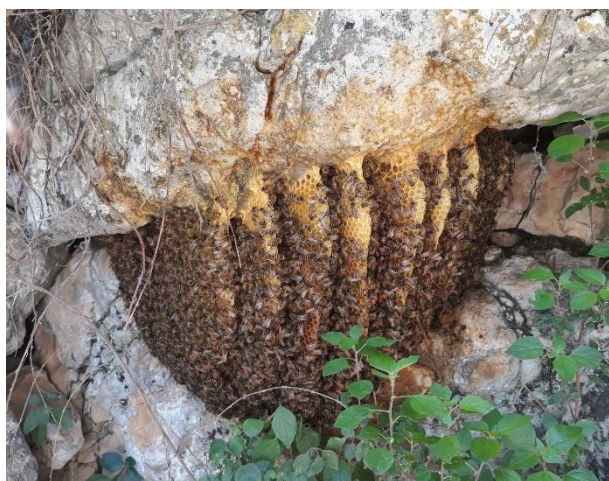
Figure 4. Wild honey bee colony from Morigerati, Salerno, Italy, September 2013.

An Italian law issued in 1992 protects A. m. ligustica as a form of wildlife: “wildlife is a public asset of the State and is protected in the interest of the national and international community”. The fact that A. mellifera is divided into various indigenous subspecies at local level means that the subspecies, especially if they are endem-