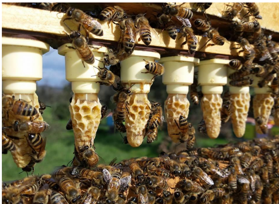
Figure 7. Honey bee queen cells obtained with the larvae grafting technique.

1899). The most striking cases, however, concern A. m. carnica and A. m. ligustica . A. m. carnica , has been introduced into vast regions of the natural distribution area of A. m. mellifera , in Central and Northern Europe, where it was preferred by beekeepers for its productivity and gentleness to the local A. m. mellifera ; in the last few decades this subspecies has also become widespread in some parts of Italy, especially in the North-East (Friuli Venezia-Giulia, Trentino Alto-Adige and Veneto regions) (Carpana et al. , 2006; Dall'Olio et al. , 2007), and according to anecdotal reports by beekeepers also in other parts of the country. A. m. ligustica , considered by many beekeeping experts to be the best honey bee for honey production, has spread to many parts of Europe and also to Sicily (where it risked almost completely replacing the local A. m. siciliana ) but also to the New World, where the black honey bee A. m. mellifera was initially introduced (Costa et al. , 2015). In Malta, there has recently been some concern regarding the conservation of the local endemic subspecies A. m. ruttneri , due to the introduction of A. m. ligustica and A. m. siciliana (Zammit-Mangion et al. , 2017).